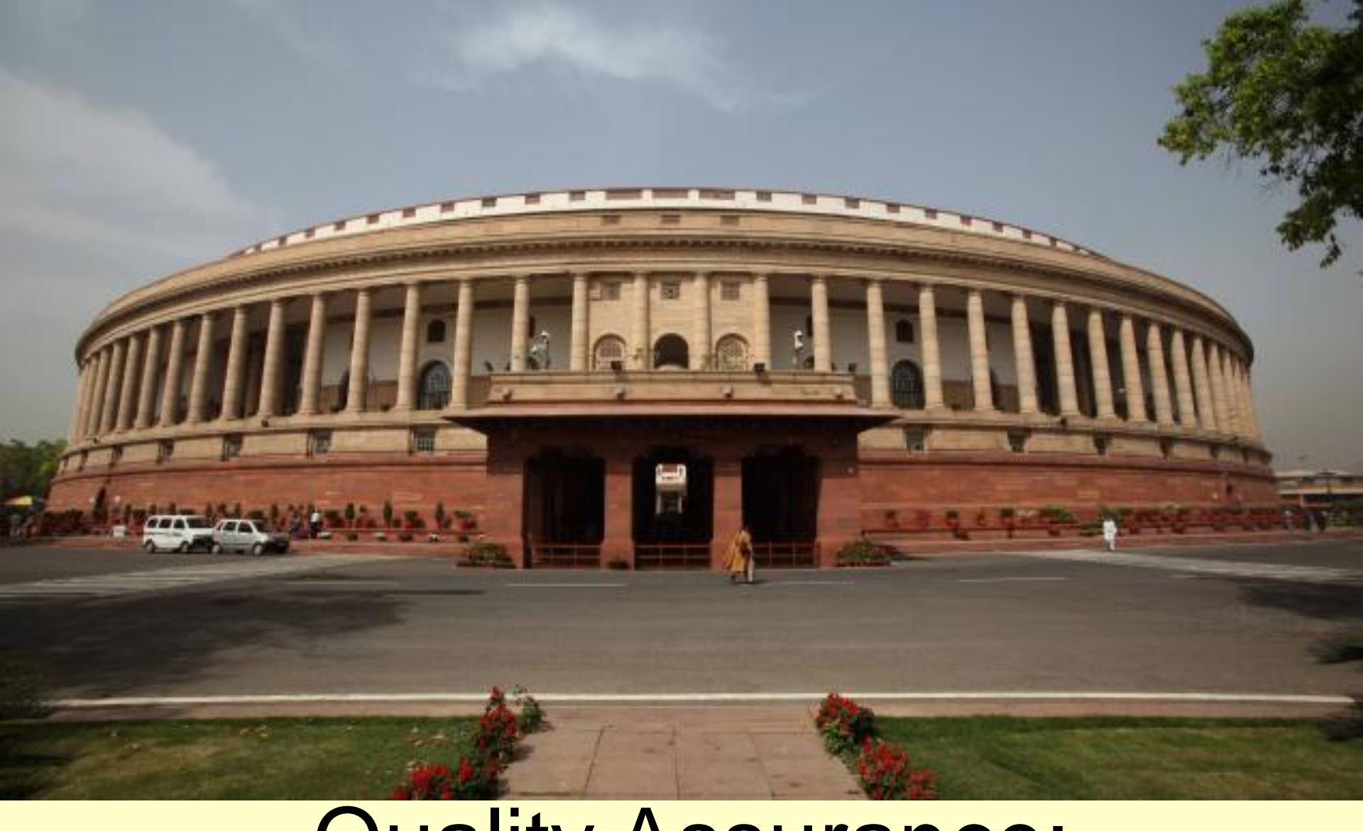
Quality Assurance: What role for Governments?